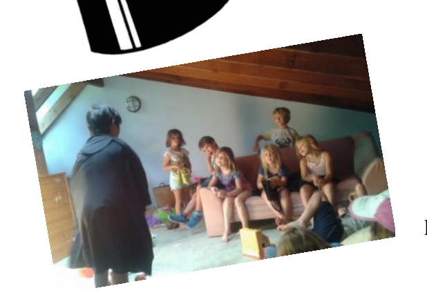
Rehearsals underway in the loft

Group 1's magical circus show has now been scheduled and will be the initial part of a Kid's Concert next Tuesday. This means that it will be an audience made up of Kinma kids only. We would like to give the children the opportunity to perform their acts in less nerve wracking circumstances...but we will take lots of photographs, we promise!