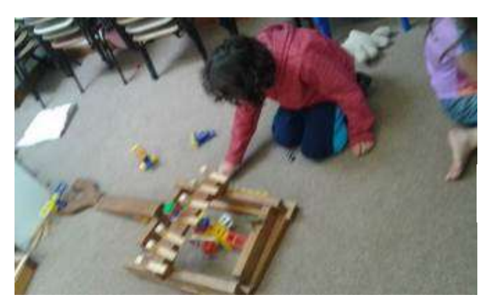
Gilad develops the runway

At a town review, more ideas came forth and the flurry of creation continued.