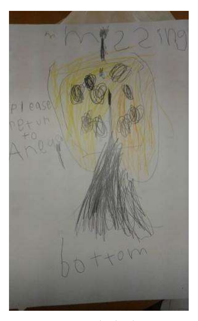
Angus's bum was also lost!

Building on the mapping, we gave the group a collective project- to build their own version of Bugalugs. In an initial discussion, it was decided that the town would need homes, offices, a dock and an airport. Different groups set off to work and immediately ideas began to ripple around the room. "We'll need a fire station." Nathanael decided so a group began on that, next a hospital, then roads and vehicles began being constructed.