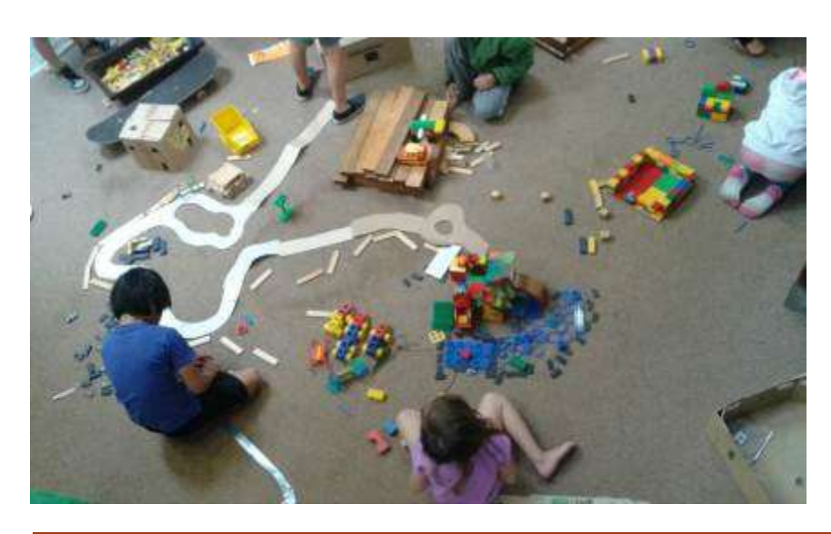
Places become linked.