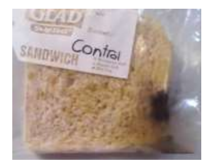
Moved with tongs directly to bag

The photos below show how they were on Day 12.