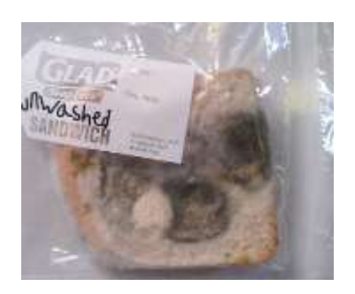
Handled by all students with unwashed hands