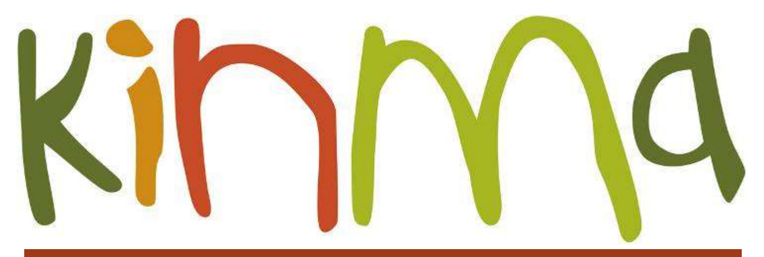
Kinma Newsletter T1 Week 5, Friday 26^{th} February, 2016