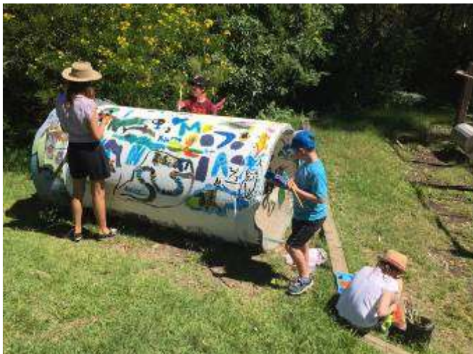
The totem pole creation seemed to reach far beyond it's physical site. Was it Tamzin whose delight reverberated on returning at day's end for next stage?