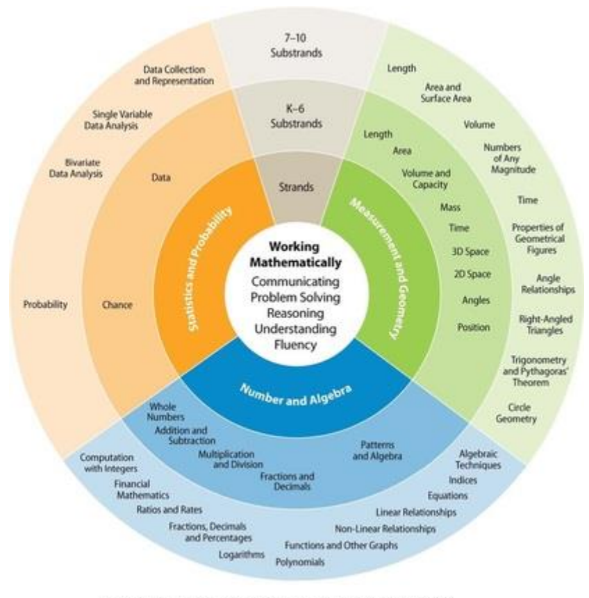
The diagram represents the relationships between the strands and substrands only. It is not intended to indicate the amount of time spent studying each strand or substrand.