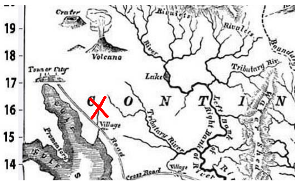
X marks the spot where the Utopian Ridge-back dragon is blocking the spring that feeds the river

Excitement has continued in Group 2 as we try to create our mythical creatures to help the Faun and his people with the dragon that is blocking the water source. As we explained in the last instalment, the aim is to design and describe in detail a mythical creature that can help the residents of a city in Utopia move a dragon along who has laid her eggs by spring that supplies a river that is their main water source.