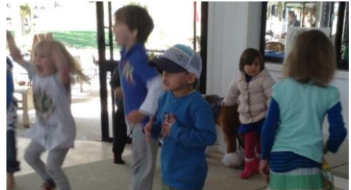
reaching the safe island