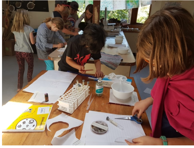
Planning, writing and mixing the cleaning formulas