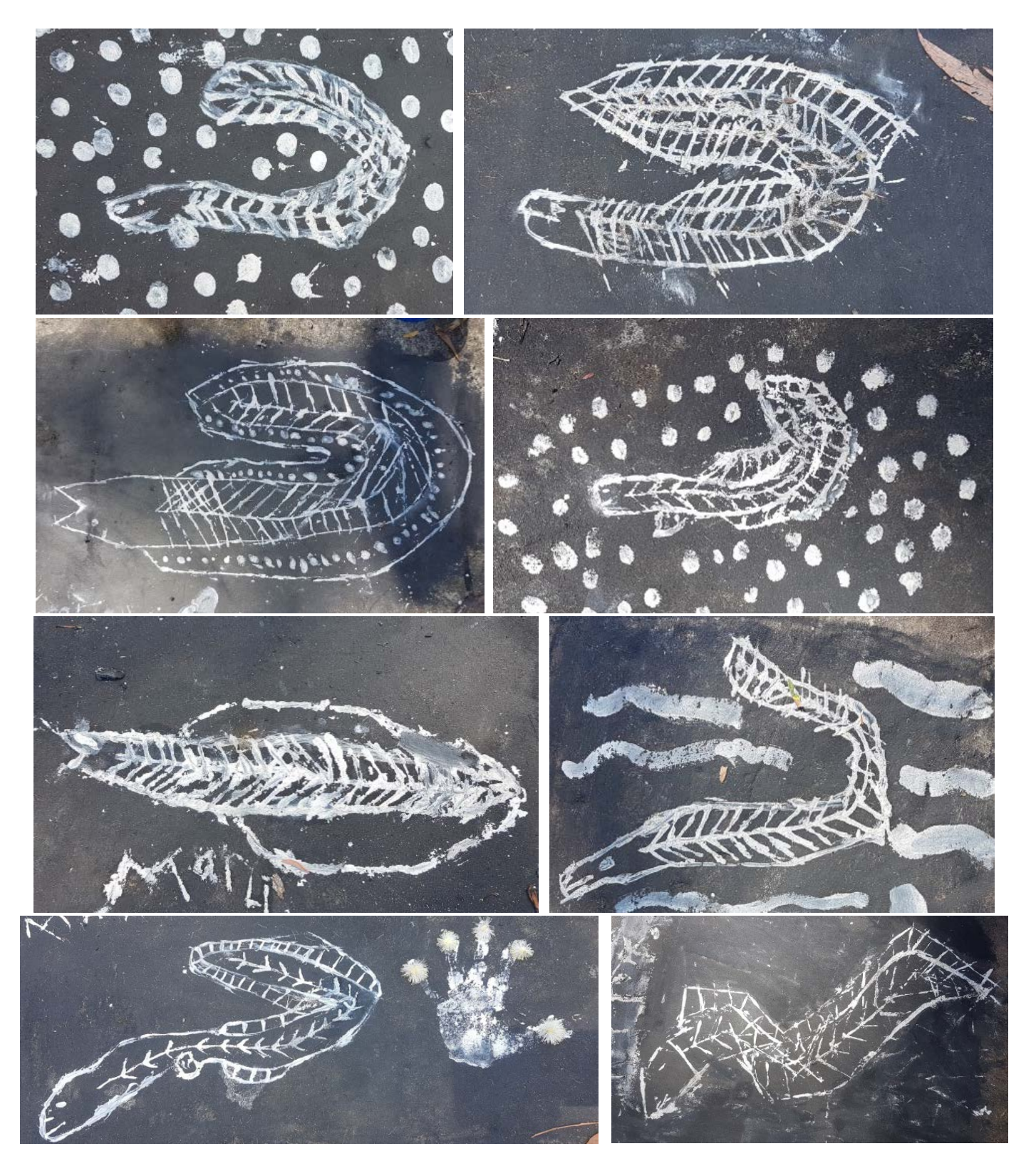
One of the most amazing lessons, for so many of the kids, was seeing the benefits of persisting, even when we feel frustrated or disappointed what we have created. Please stay tuned for more of our artistic adventures.