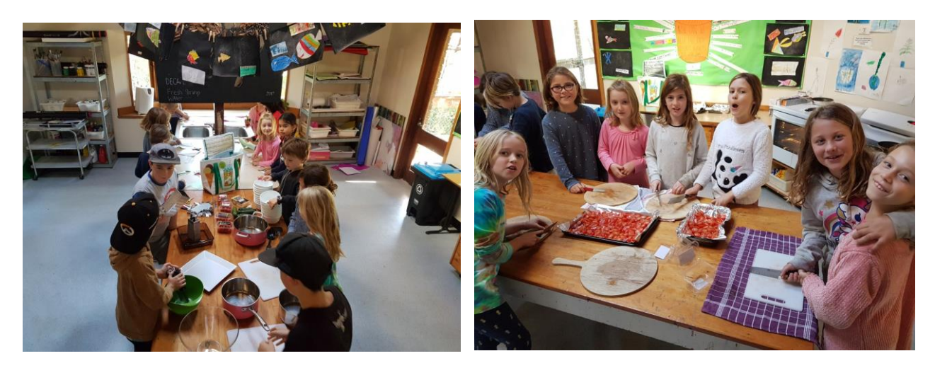
We made fried zucchini and roasted tomato pasta...