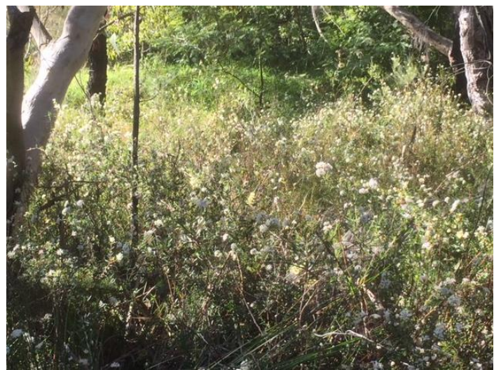
Spring is just around the corner