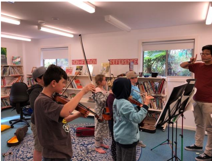
Violin lessons in Primary