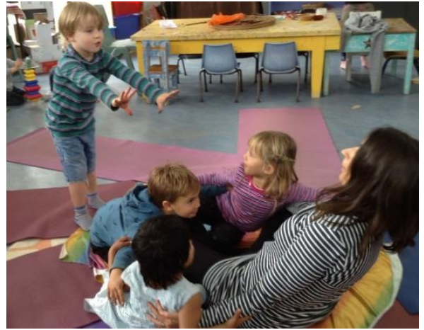
Sundance, a game of “Yoga, yoga, pose and relaxation completed the class