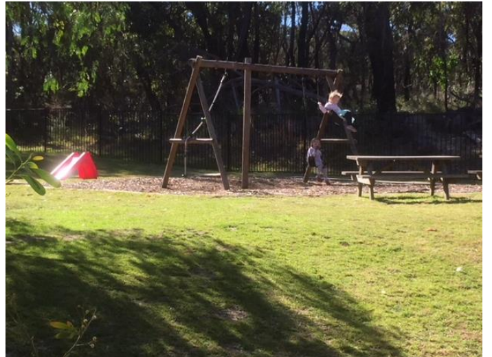
Early Morning play in Preschool