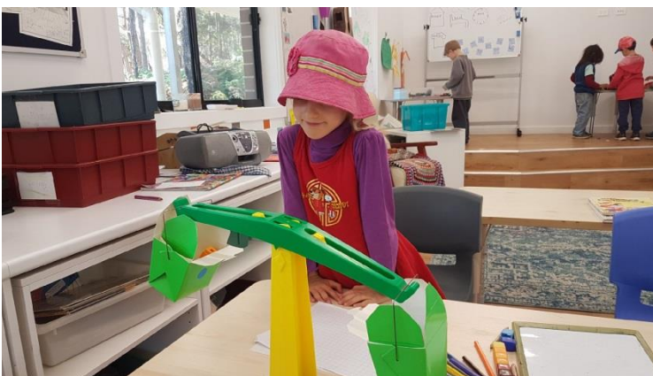
Group 1 Maths