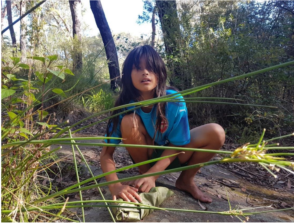
Wrapping up freshly picked monks ear mushrooms in an Taro leaf to cook up later.