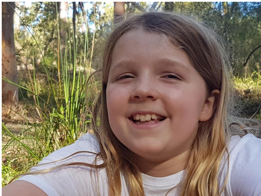
Just enjoying the afternoon.

We then lit a fire and many of us warmed our bodies, hearts and food as we sat around it. Unfortunately, Daylight saving meant that we had to put the fire out before it was dark so we could get ready for bed.