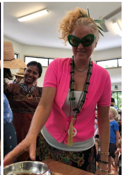
There was lots of drama and tension as the story unfolded