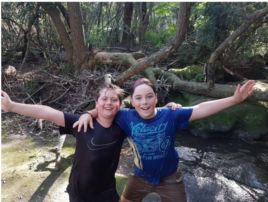
Best of friends.