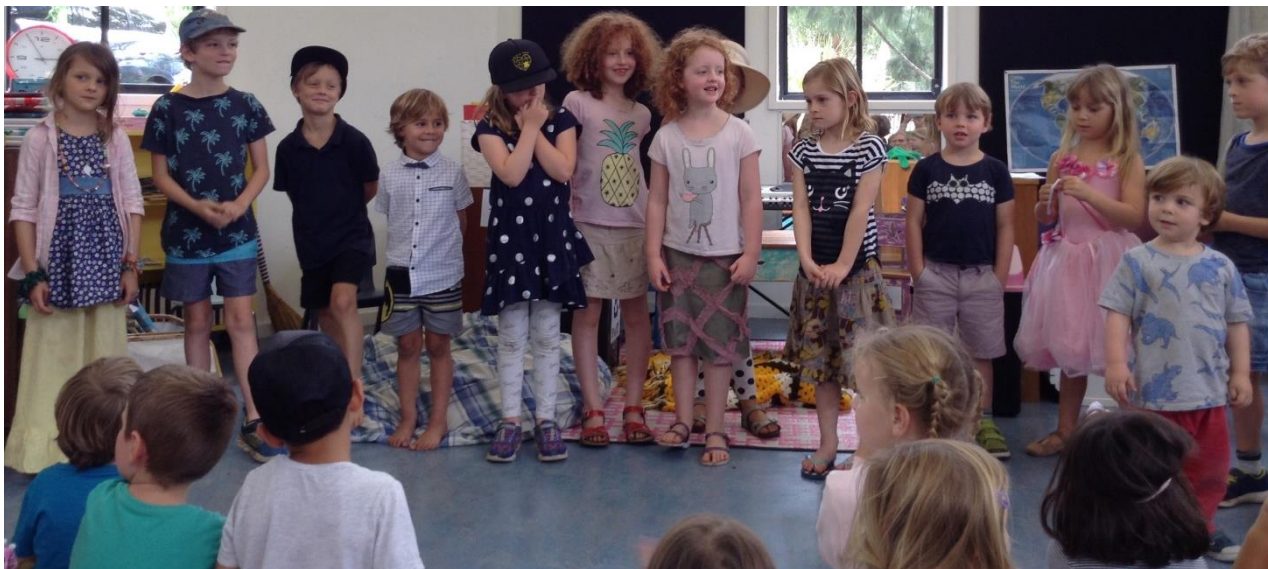
After the show, some of the transition children, accompanied by Group 1 children led us in singing "Zum galli galli"