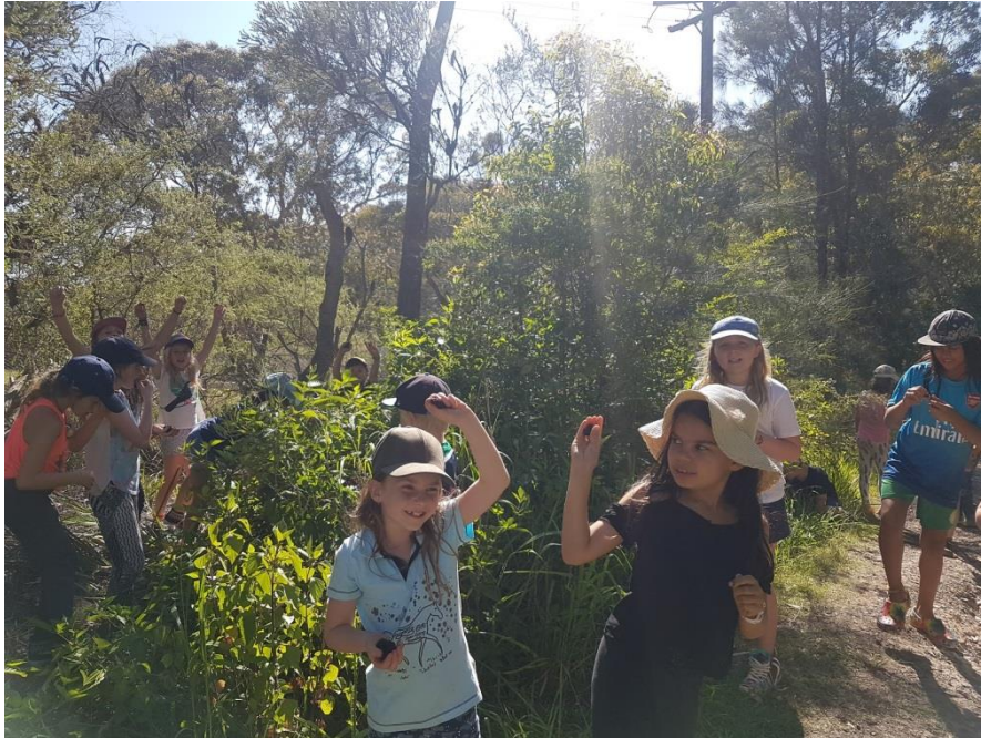
Picking fresh blackberries. Yum!

We have been planning the class sleepover since Term 2 and last Friday, it finally arrived. We had afternoon tea before playing games on the field. We then headed down to our beloved creek for an extended play.