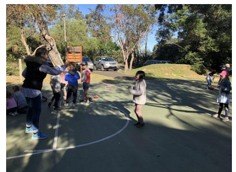
skipping games and elastics