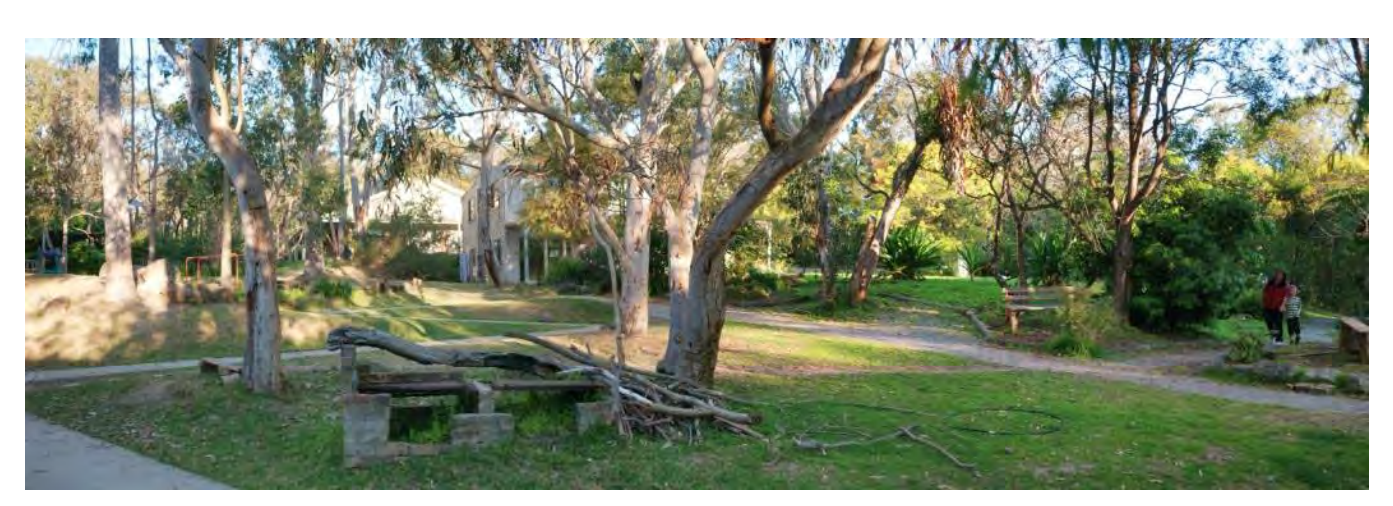
Page 1 of 38