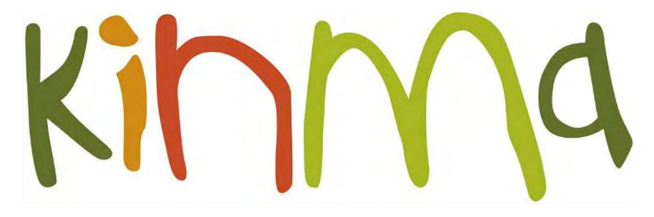
2021 Annual Report for NSW Education Standards Authority