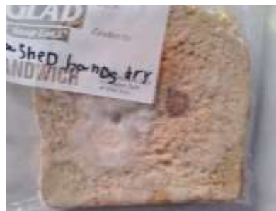
Handled by all students with washed dry hands

The bread made moist by the washed wet hands developed fungi the fastest and had the greatest variety of fungi and bacteria by Day 12. After a slow start, the bread handled by unwashed hands by Day 12 looked pretty ghastly but was dominated by one black fungus.