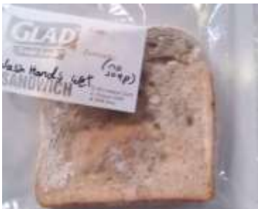
Handled by all students with washed wet hands