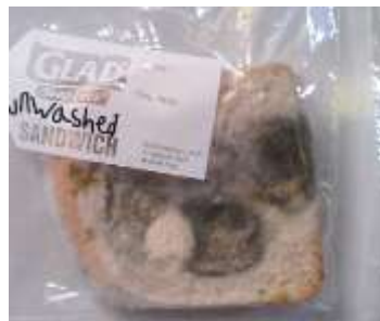
Handled by all students with unwashed hands