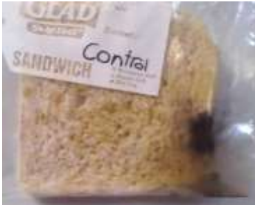
Moved with tongs directly to bag

The photos below show how they were on Day 12.