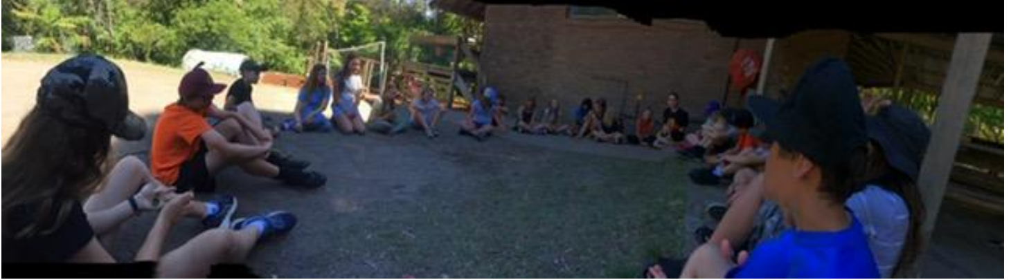
Listening to song