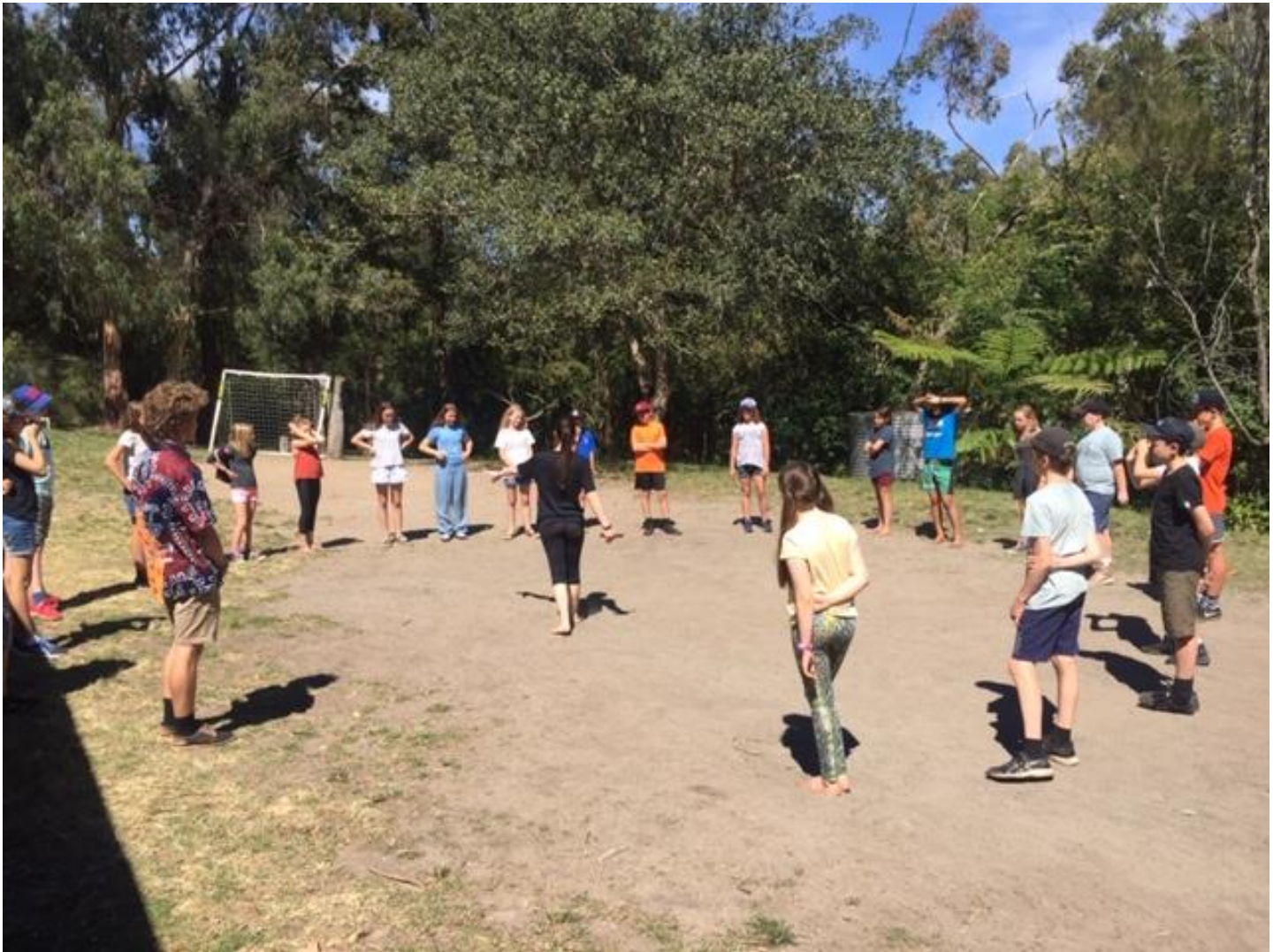
Preparing to dance!