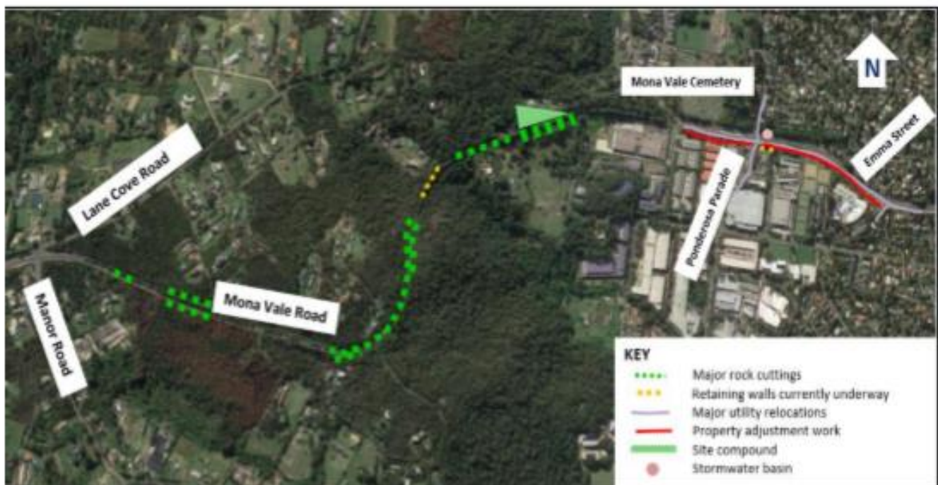
Note: Diagram not to scale and for general information and illustrative purposes only