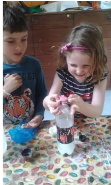
Willow quickly tries to put on a balloon.