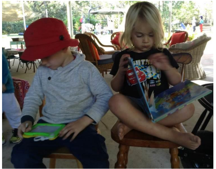
Diesel and Leon - in the entrance area at home time