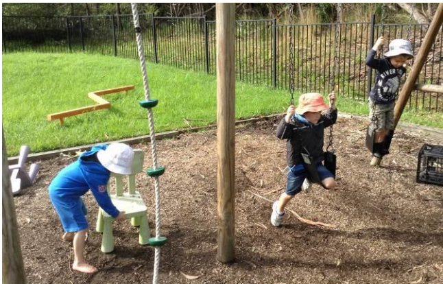
The swings are always popular