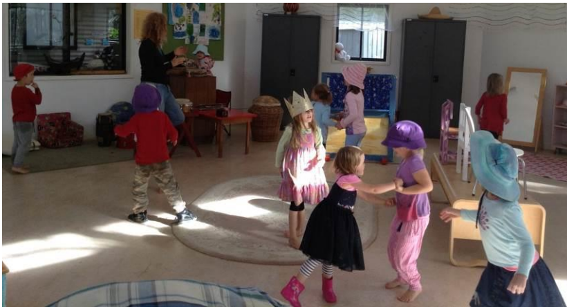
Expression to music