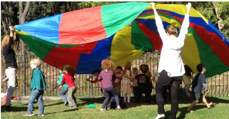
Parachute games are a great favourite, the children working cooperatively to keep the big ball on the parachute