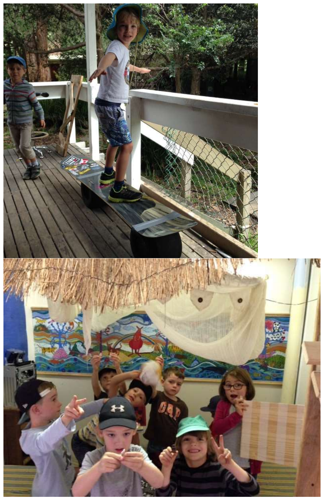
Looking forward to seeing you at the yurt farm !!