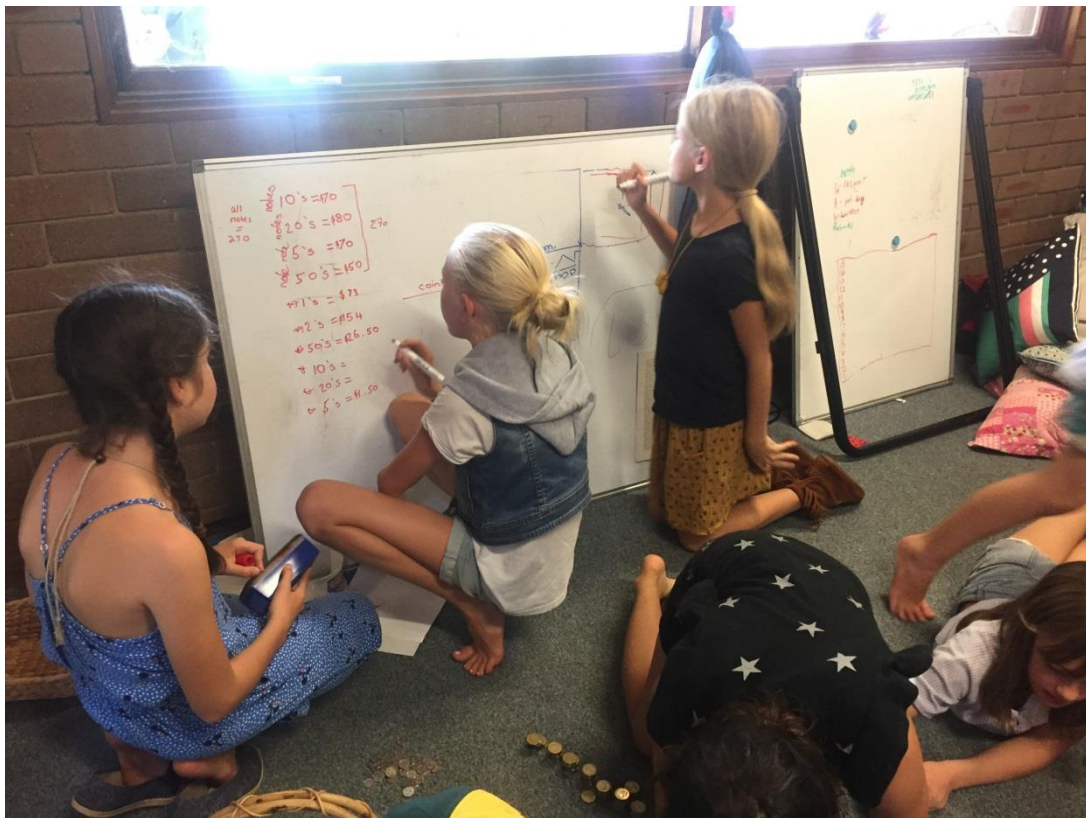
Group 3 busy calculating how much money they managed to raise at the shopping centers.