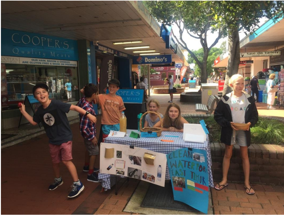
The children at Forestville Shopping Centre on 'World Water Day', raising money for water filtration units.