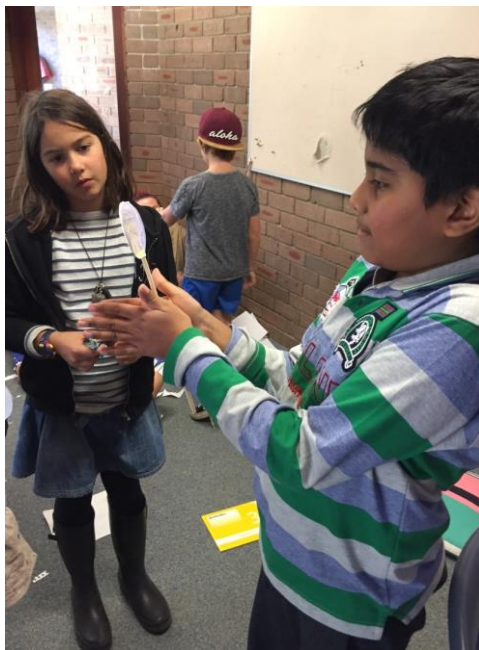
Optical illusion spinners