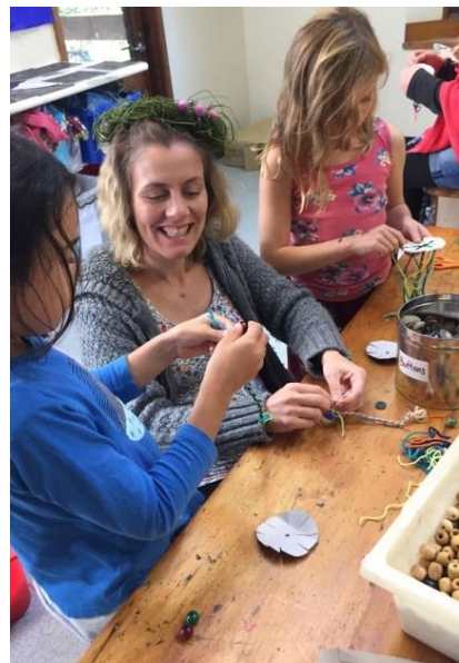
French style friendship bands