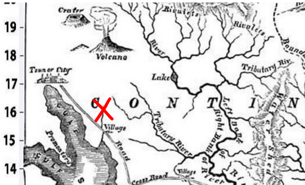
X marks the spot where the Utopian Ridge-back dragon is blocking the spring that feeds the river

Excitement has continued in Group 2 as we try to create our mythical creatures to help the Faun and his people with the dragon that is blocking the water source. As we explained in the last instalment, the aim is to design and describe in detail a mythical creature that can help the residents of a city in Utopia move a dragon along who has laid her eggs by spring that supplies a river that is their main water source.