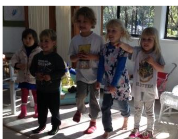
the first island

Lots of laughter, lots of listening, lots of fun, lots of turn taking, lots of squealing, lots of thinking, lots of recalling and remembering, lots of learning.