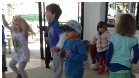
reaching the safe island