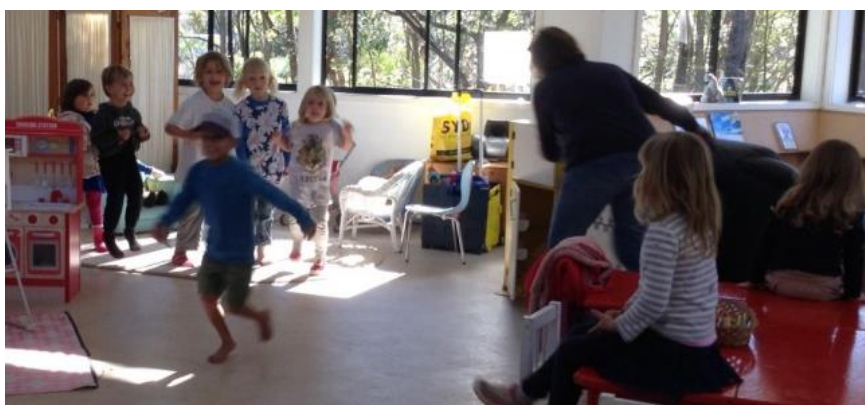
running the gauntlet of Morag the hungry shark. “J’ai faim, j’ai faim”