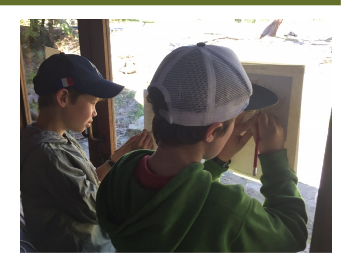
Mateship, close and concentrating