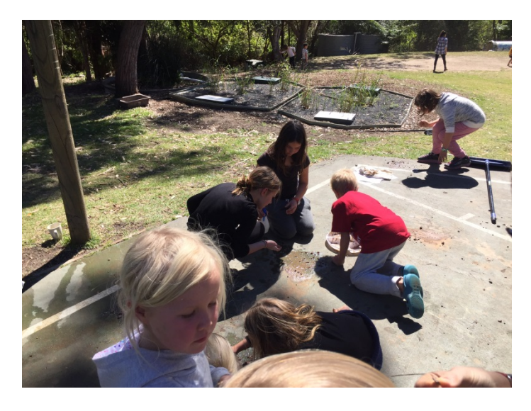
Sunshine, collaboration, natural, enthusiastic

Thank you to the children, parents and teachers for making such good energy yesterday!