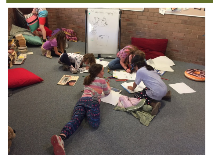
Joy, new friendships, groups all merging