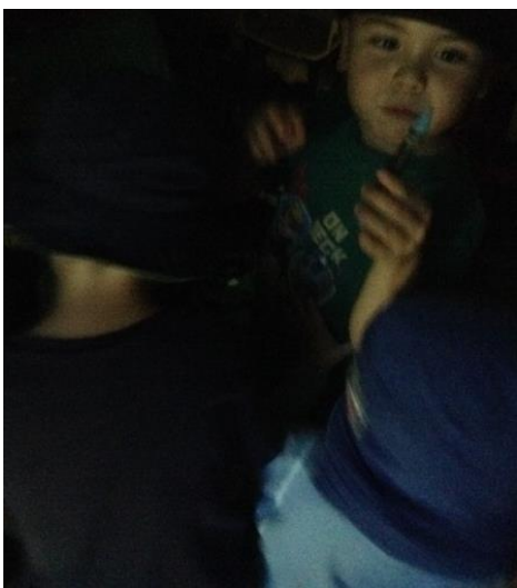
We searched for the darkest place in the school to make our "glow in the dark" crayons work