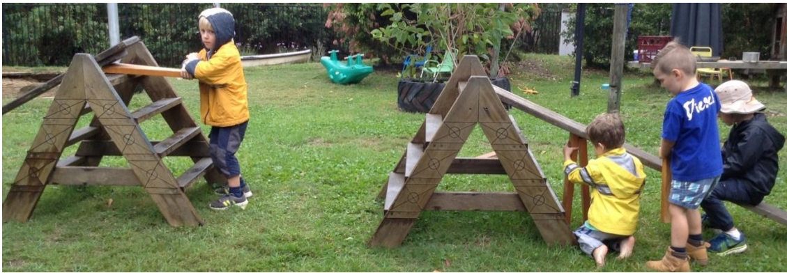
Various ideas were tried including levering the planks with wood blocks