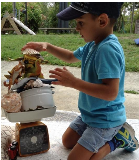
We balanced lots of things to weigh them