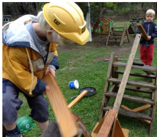
M and L made the final touches, knocking wood to make sure it was stable.

Then it rained so hard we all had to leave the site.