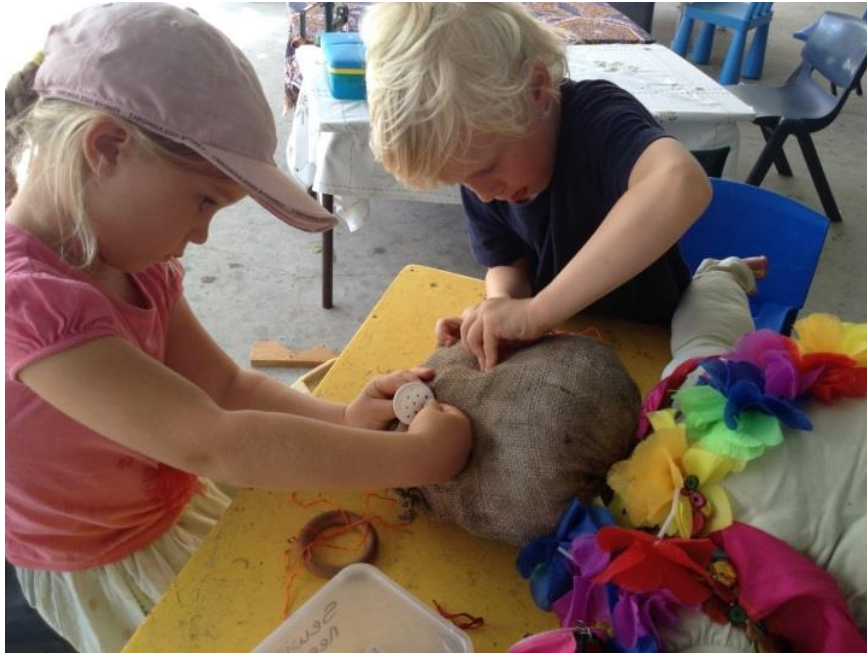
The scarecrow has been refurbished