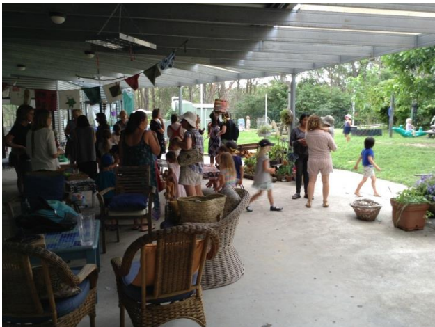
Preschool Alumni Afternoon Tea