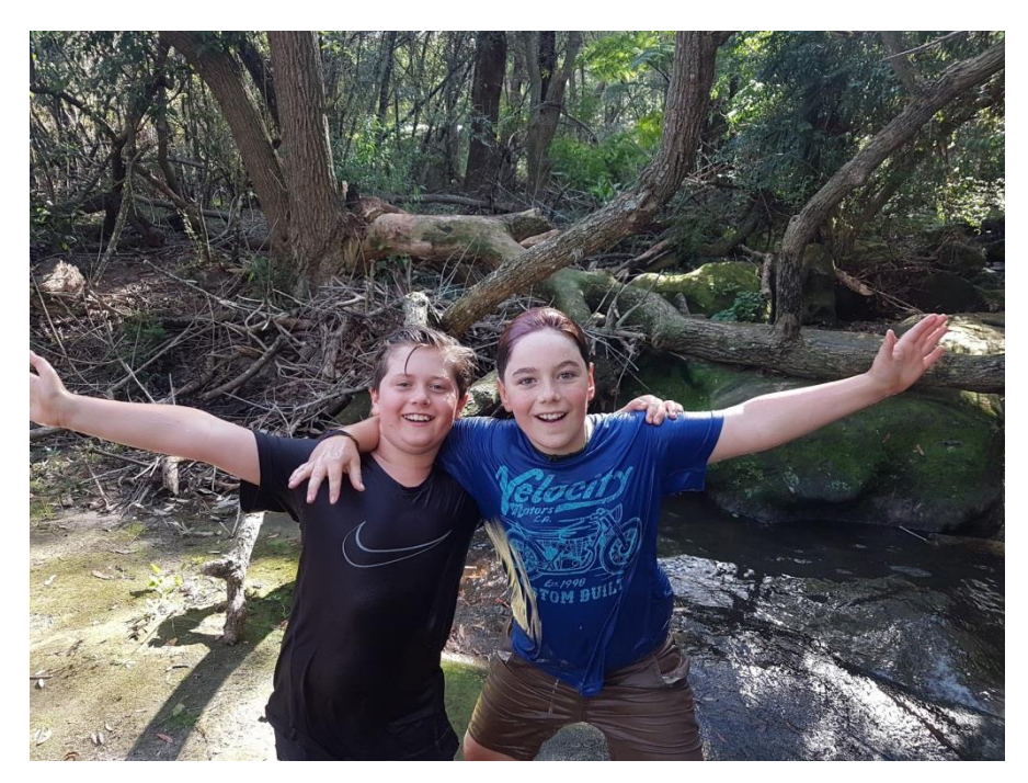
Best of friends.