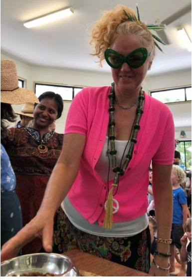
There was lots of drama and tension as the story unfolded