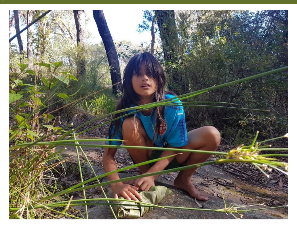
Wrapping up freshly picked monks ear mushrooms in an Taro leaf to cook up later.