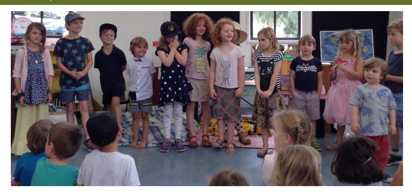
After the show, some of the transition children, accompanied by Group 1 children led us in singing "Zum galli galli"