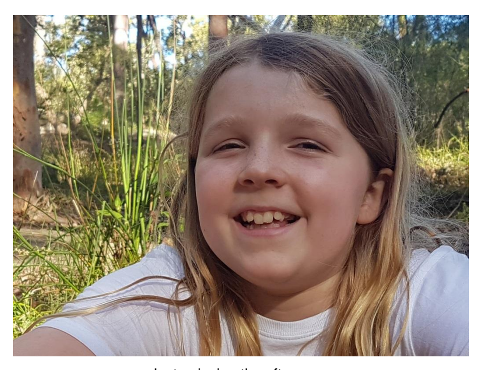
Just enjoying the afternoon.

We then lit a fire and many of us warmed our bodies, hearts and food as we sat around it. Unfortunately, Daylight saving meant that we had to put the fire out before it was dark so we could get ready for bed.