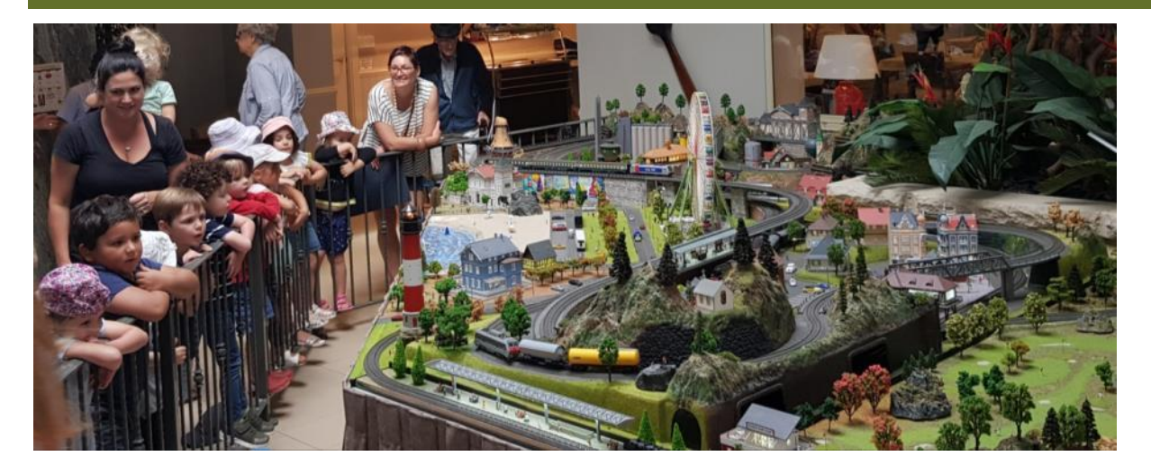
We were then invited to see the "super special" railway, so after saying goodbye to the residents, we went through the Nursing Home to find the track. It was amazing. The children were very interested in the detailed scenes and discussed which train they liked and why. There was a button to press to start the engines moving, which was popular.