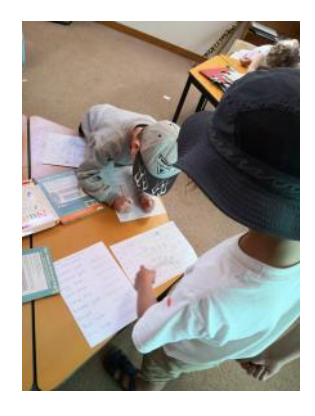
Tornado in a jar

As part of our study on weather we learnt about tornadoes, how they are created and how they move. We then replicated our own tornadoes in a jar. The children wrote a procedure (or sequenced a pre-prepared procedure), followed directions as a duo or trio, collected resources and experimented with creating a vortex. Some children added miniature lego pieces to show the effects of flying debris! We include a copy of Nate's procedure.