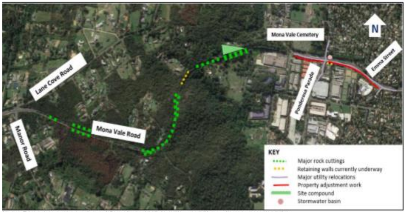
Note: Diagram not to scale and for general information and illustrative purposes only