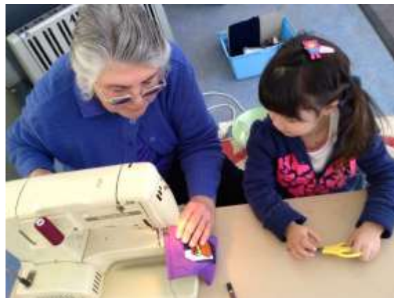
Yuka designed a little bag to sew.