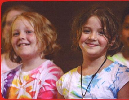
Holding a Harmony