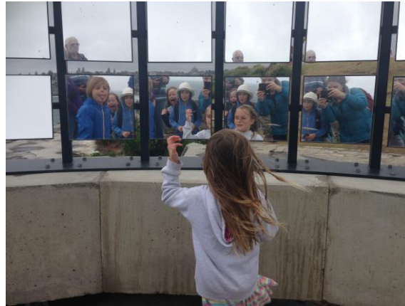
Group 1 enjoyed looking sculptures. funny faces in this

Walking along the coastline, the children in stumbling upon new and sometimes strange- We loved counting the mirrors and pulling sculpture!